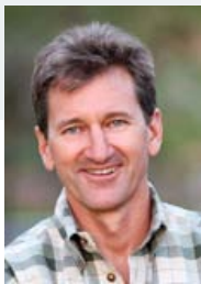
Director, Bureau of Economic Geology

“You could argue they do at some level, but it’s not a big deal unless you start having earthquakes that cause damage to infrastructure, and that could be wellbores or pipelines or buildings or bridges,” he said. “If the earthquakes are large enough and in areas where those are located, then they can cause damage and that damage can have secondary damage on environmental systems.”