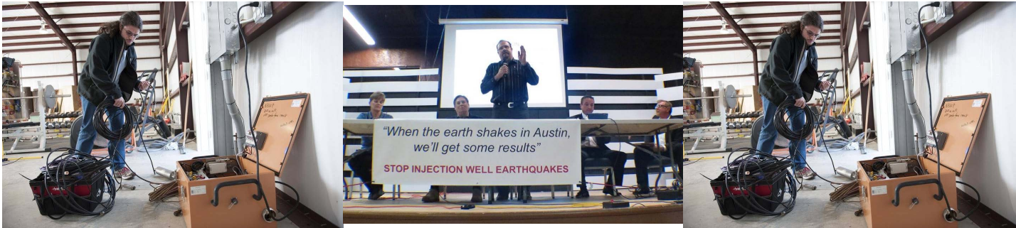
A speaker at a public meeting in Azle, in January 2014, discussing area earthquakes.

System will augment 16 seismographs already in place across the state