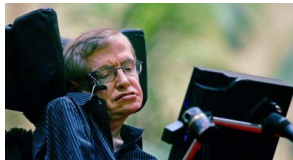
The Media Is Ignoring The Most Important Part Of Stephen Hawking's Comments On Trump