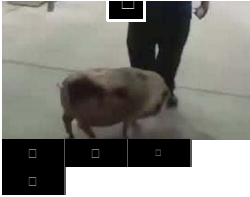
Pot-bellied pig on the loose at Texas gas station