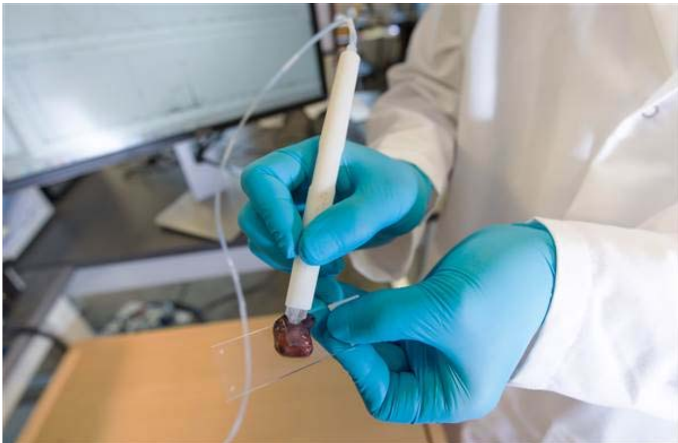
The MasSpec Pen is a handheld probe that can non-destructively analyze human tissue samples to identify cancer.